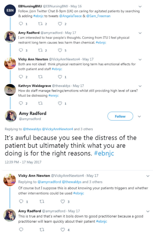
Figure 2 Concerns about restraining patients.

The use of restraint is often seen as a balance between risk and patient benefit. Many participants highlighted the importance to consider the intent behind a particular